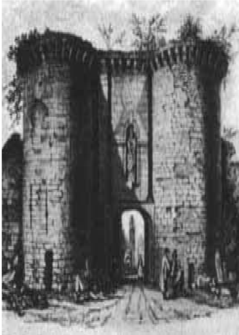
The Tower at Rouen Castle wherein Joan was threatened with